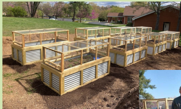
How it's growing