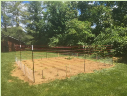
How it started

Covenant received an Earth Care Mini-Grant for its Rain Barrel Project from The Earth Care Subcommittee of Presbytery. The project will promote environmental sustainability and food security and serve as a valuable educational tool for our preschoolers and church members and friends. Many thanks to The Presbytery for approving our mini-grant!