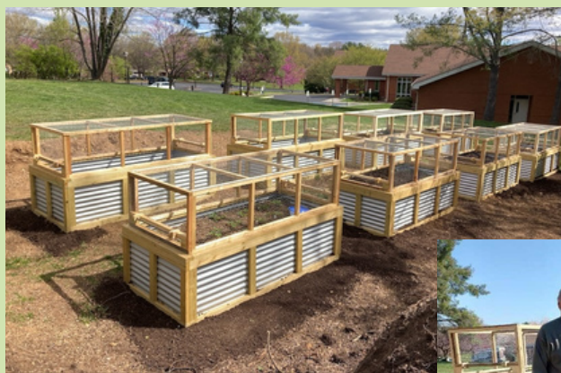
How it's growing