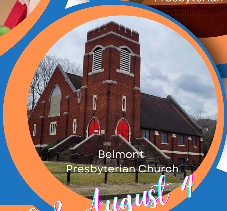
Belmont Presbyterian Church