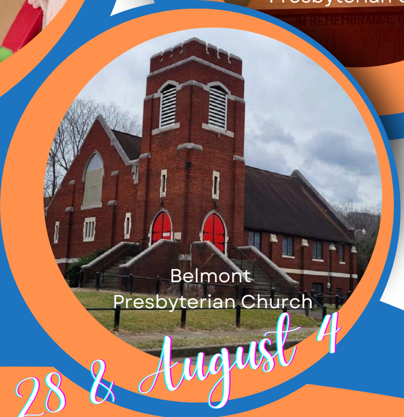
Belmont Presbyterian Church