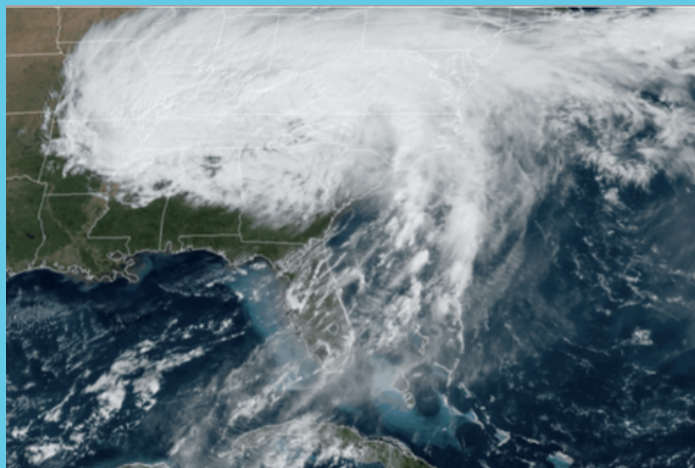
Satellite imagery of Tropical Storm Helene moving through the Southeast U.S. September 26-27, 2024. Produced by the National Weather Service.

In other words, higher temperatures create more energy for hurricanes. The unprecedented destruction of Hurricane Helene is a reminder of how essential it is for us to address the causes of the climate crisis fueling natural disasters.